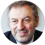
Nuno Crato Portugal